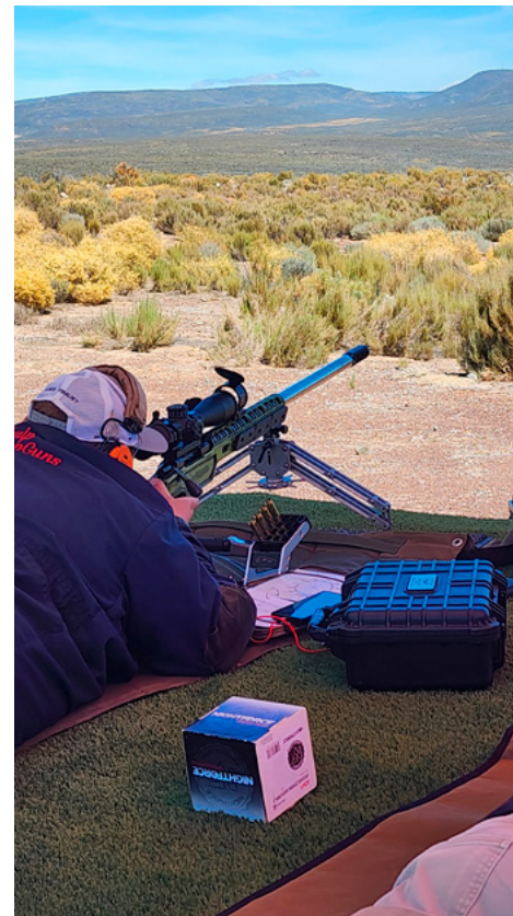
1 James Preyser 2nd Place

TOTAL SCORE Total Nr. of HITS 7 18 7 375 CT 375 CT 33 XC 9 10 12